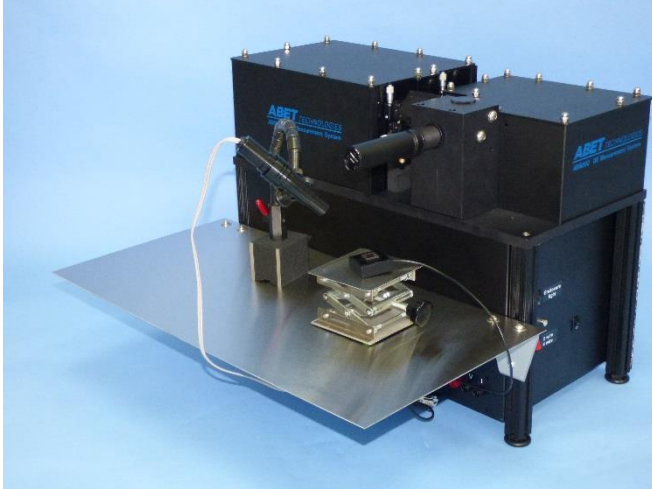
Abet Technologies Model AB6000 Quantum Efficiency measurement tool (dark enclosure not shown)