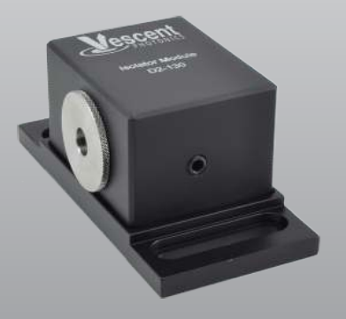
D2-130 Isolator Module

The D2-130 isolator module contains a 35 dB isolator and 1/2-waveplate in a rugged and compact package. The beam height matches other D2-series modules. The D2-130 can be used whenever extra isolation is desired, such as added isolation prior to fiber coupling.