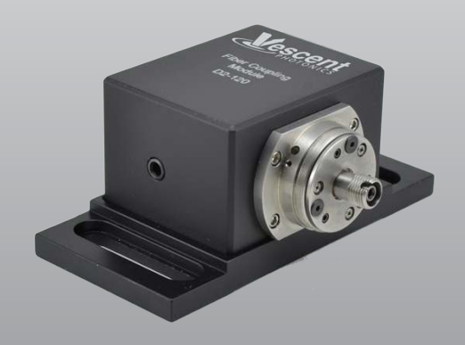
D2-120 Fiber-Coupling Module

The D2-120 is designed to facilitate coupling of a laser beam into either a single or multimode optical fiber. The module incorporates an optical isolator, prior to the fiber facet to reduce optical feedback. An FC fiber receptacle is provided with an aspheric AR-coated condensing lens and six degrees of freedom for alignment optimization: 3 linear (x, y, z), 2 angular (azimuth, elevation), and 1 rotational (for PM fibers). The incoming beam height matches other D2 series lasers and optical modules.