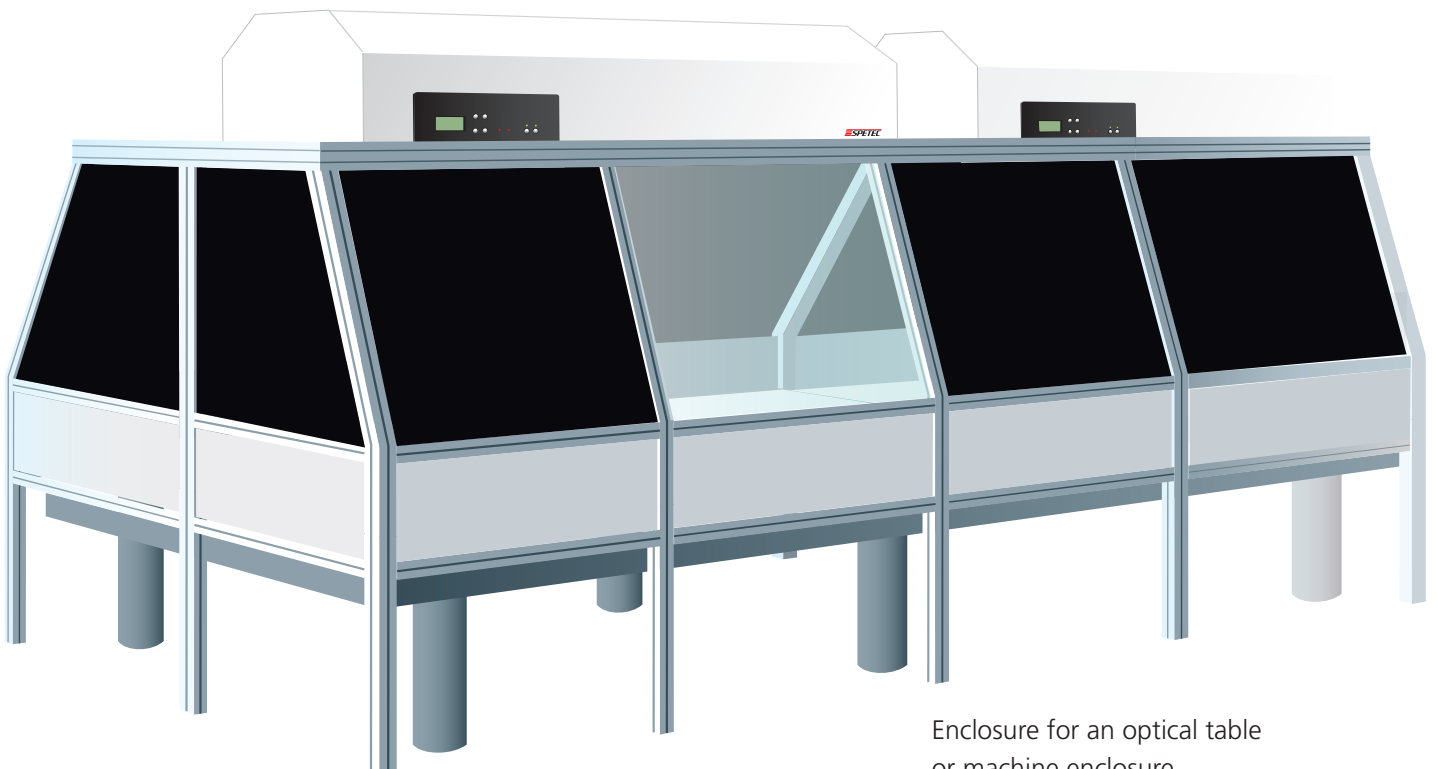
Enclosure for an optical table or machine enclosure

If required, a laminar flow module (FFU) can be fitted in the top of the enclosure to provide clean room conditions within the enclosure.